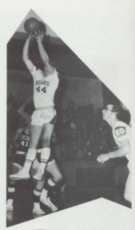
"This is a chinch."